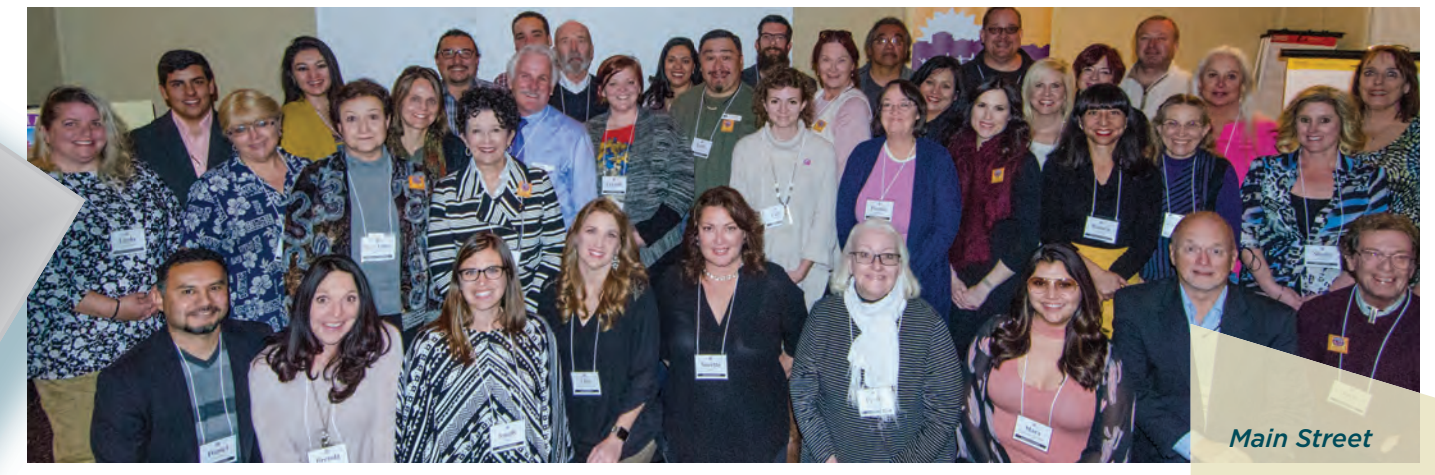
Local New Mexico MainStreet directors gather in Santa Fe for their Winter Quarterly and advocate as a coalition at the state capital.

Why advocate and lobby for Main Street? Main Street America organizations have many interests that are impacted by government policies—whether it's ensuring funding for programming (appropriations), incentives for encouraging reuse, or legal protections for historic districts. For these reasons and more, it is beneficial for Main Street stakeholders to undertake advocacy and lobbying activities.